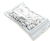
Sachets & bags containing bulk products